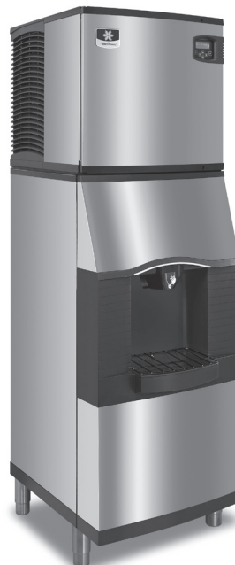
Indigo Series 522 Ice Machine SFA-191 Ice & Water Dispenser