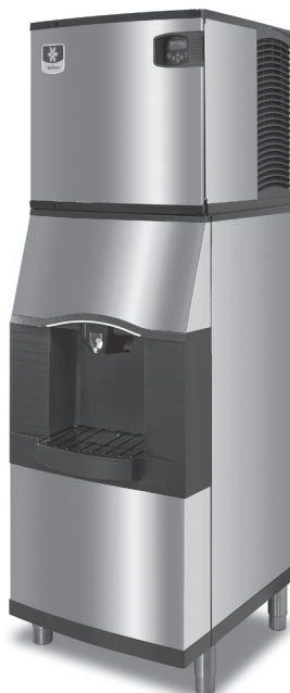
Indigo Series 522 Ice Machine SPA-160 Ice Dispenser

Ice only dispense, with coin-op and room card dispensing control options